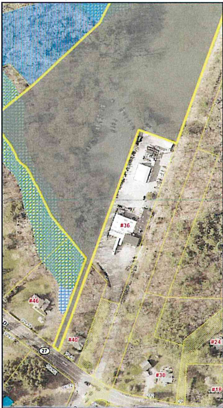
The aerial photo is taken from the Town of Sudbury GIS maps and shows the existing fields and parking area (the gray area defined by a wider yellow line) adjacent to the former railroad right-of-way under construction for the Bruce Freeman Rail Trail. The building at #36 is the TI-SALES site. Wetlands are shown in the blue and green hatched areas to the left, or west of the existing 20-foot wide access from Hudson Road.