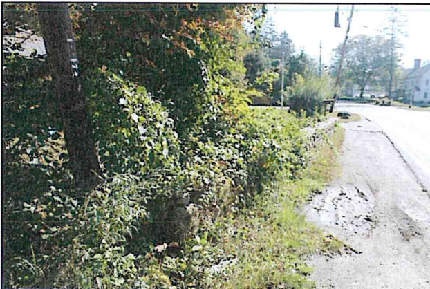
View at driveway intersection with Hudson Road looking east.