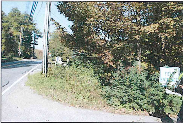
View at driveway intersection with Hudson Road looking west.