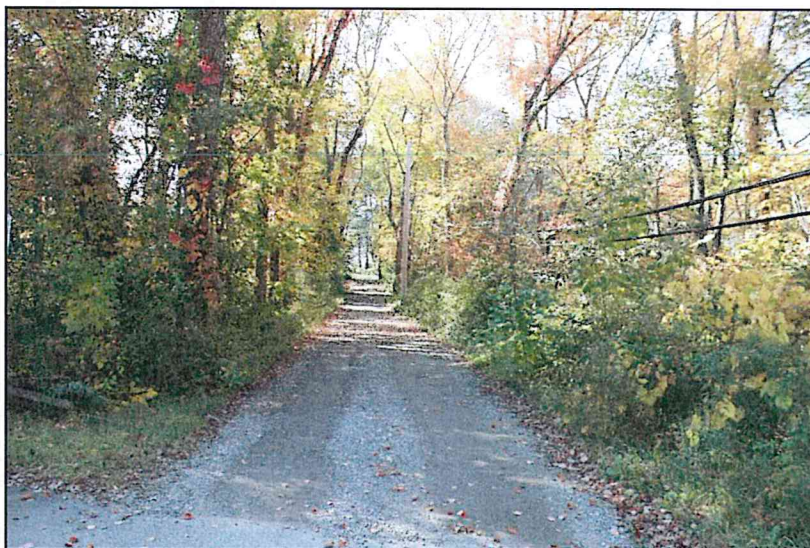
View of driveway from existing parking area, looking south toward Hudson Road.

These requested funds will be used to hire the appropriate consultants to conduct a survey of the driveway access, determine the extent and type of wetlands (it has been suggested that there are wetlands located to the east of the driveway, not just west of the driveway), work with town staff to determine whether an 18-foot wide, two-lane driveway can be designed and engineered, permitted, and, eventually reconstructed. The Town will also seek additional funds through grants or funding awards as the project design is underway.