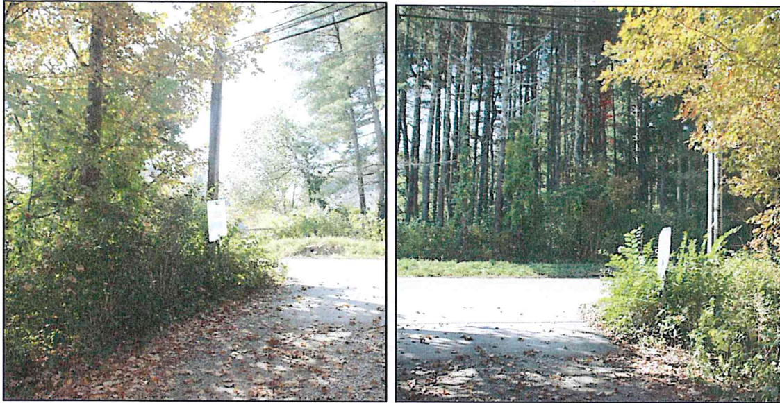
Views left and right of driveway at Hudson Road.