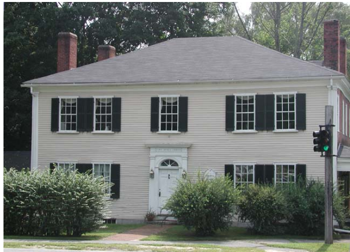
(Hosmer House, c. 1820)

Grinnell Memorial Hosmer Memorial Walker Walsh Alumni Nature's Outdoor Classroom