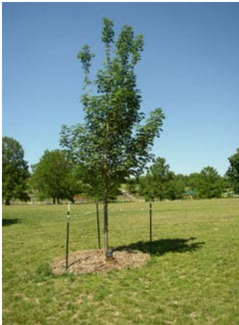
Newly Planted Memorial Tree

Payment is due at the time the order is placed. Printable Order Form