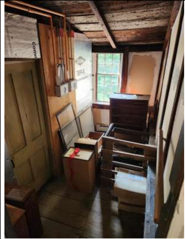
Space outside Art Storage