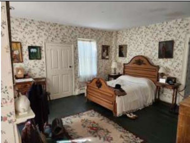
2 nd Floor, bedroom, no issues