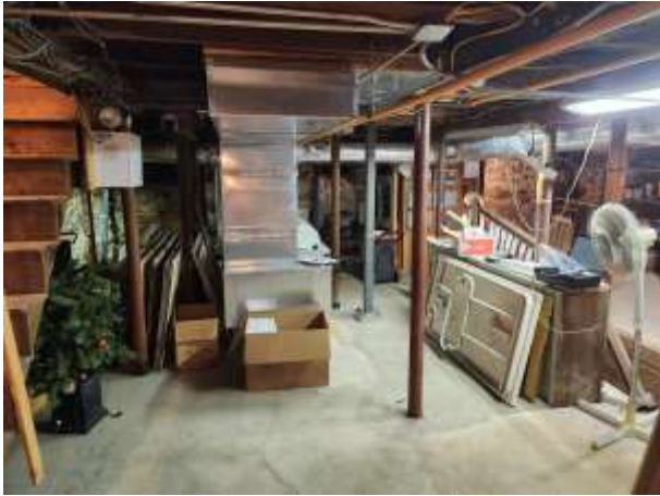
Basement Area, dry conditions