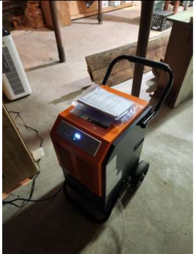
Unit operating in basement