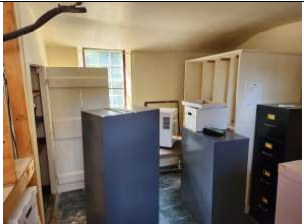
2 nd Floor, Art Storage Room, no issue