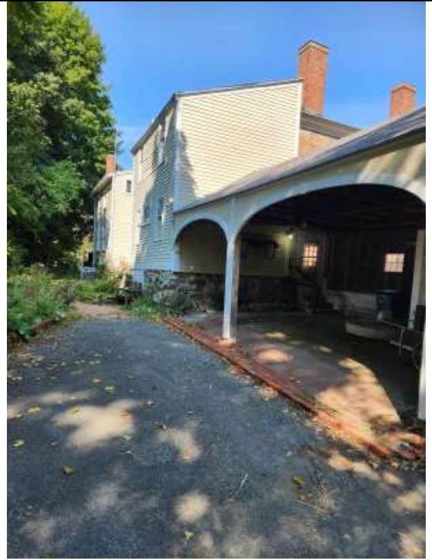
Location of exterior comparison sample