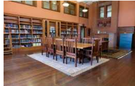
Goodnow is a place for quiet learning...