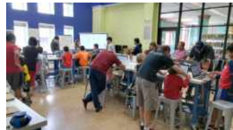
...as well as community and collaboration.

Although the Library is currently shuttered, it remains a hub of information, ideas, and innovation through greater accessibility to online resources and creative virtual activities. In a recent project, the Library and the Foundation partnered to sponsor a reading challenge – Goodnow Reads for a Good Cause – that raised funds for HOPEsudbury. This collaboration encouraged reading for all ages, while helping our neighbors in need.