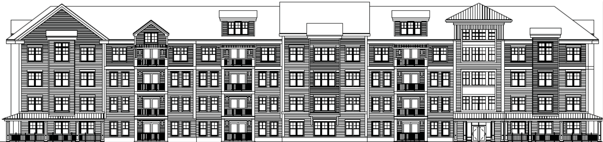
Typical four-story building elevation submitted by Sudbury Station developer