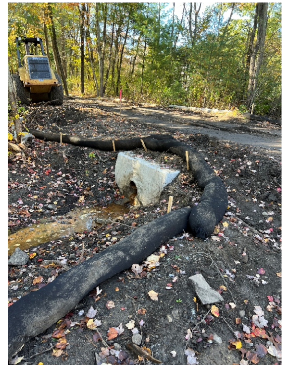
Photo 8: Sta. 306+50 looking at the newly installed concrete headwall.