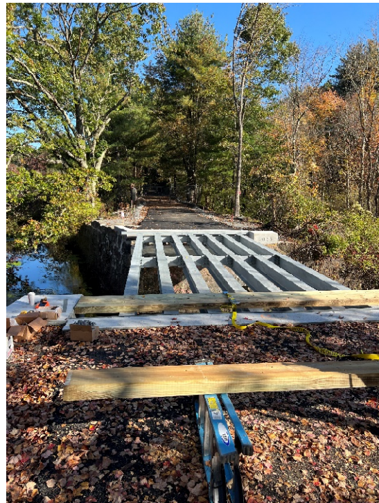
Photo 4: Sta. 126+00 looking north at the Hop Brook Bridge construction.