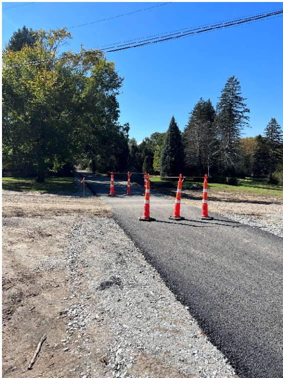
Photo 11. Sta. 320+50 looking south towards the at-grade crossing at the Fairview Farms driveway.