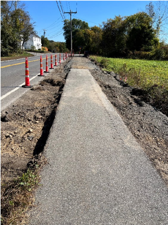
Photo 9. Sta. 1102+00 looking east towards to the Davis Field parking lot entrance.