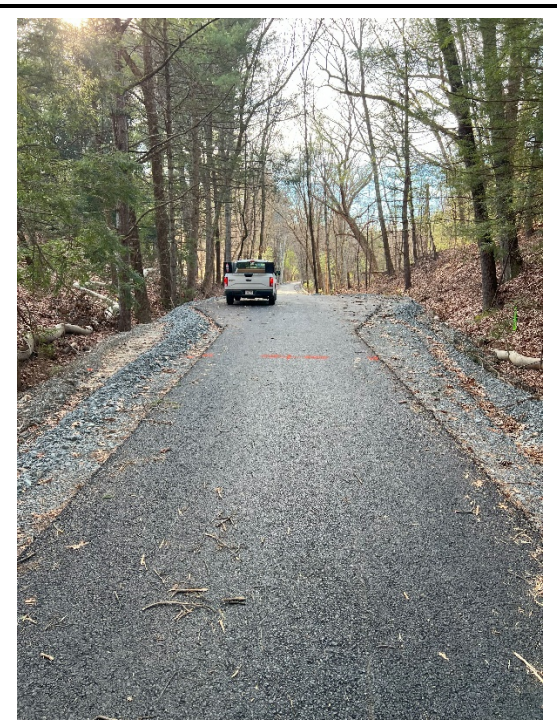
Photo 6: Sta. 234+00 looking south at the paved path and vehicle turnaround.