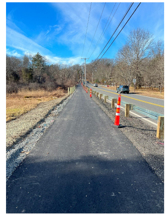
Photo 9: Sta. 1104+00 looking west at the paved spur path and installed guardrail.