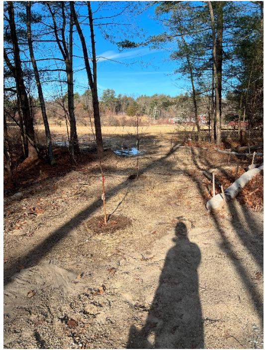
Photo 5 : Sta 212+00 looking at the planted vegetation near the wetland replication area.