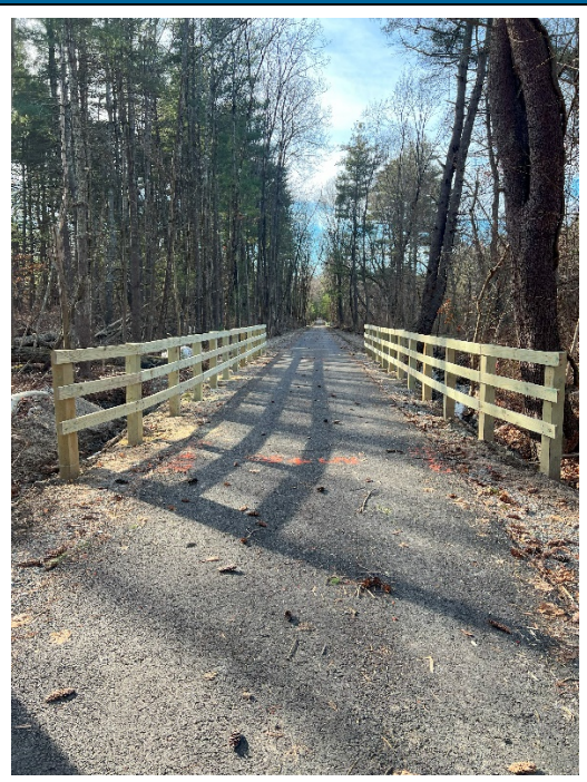
Photo 2: Sta. 167+50 looking south at the timber fencing across the 48" culvert.