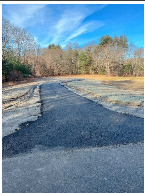
Photo 3: Sta. 184+50 looking west at the Parkinson's Lot spur path.