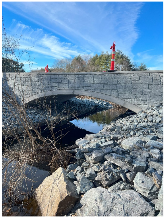
Photo 7 : Sta. 164+50 looking at the newly constructed Pantry Brook bridge.