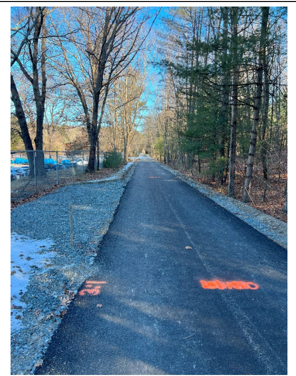
Photo 8 : Sta. 181+50 looking north at the proposed rest area location.