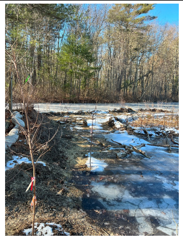
Photo 9: Sta. 212+50 looking at the proposed wetland replication area.