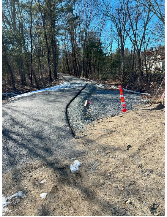
Photo 11: Sta. 307+50 standing at North Road looking south at the trail and proposed rest area.