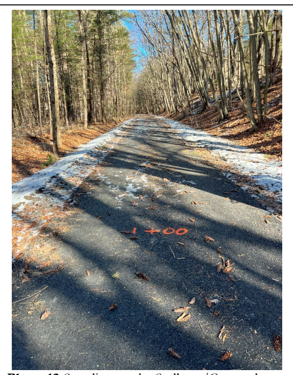
Photo 12: Standing on the Sudbury/Concord town line looking towards Concord.