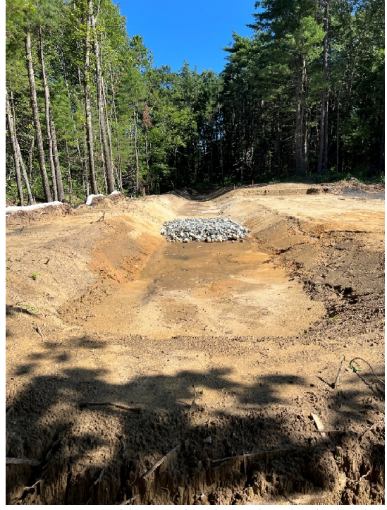
Photo 7: Looking at the detention basin in the proposed parking lot location