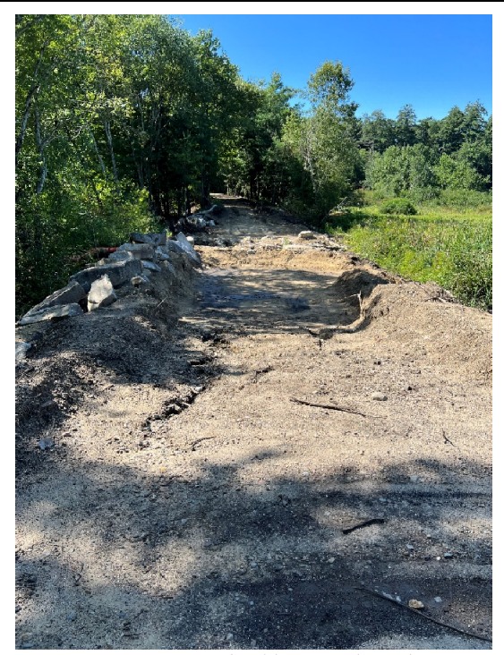
Photo 8 : Sta. 265+00 looking south at the Pantry Brook bridge approach