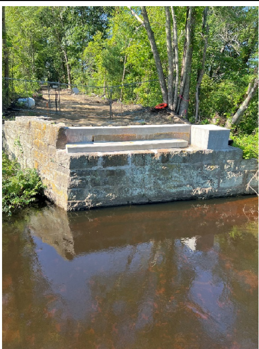
Photo 3: Sta. 126+50 looking south at the southern bridge abutment and backwall cap of the Hop Brook bridge