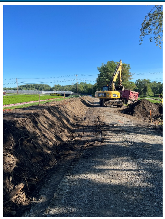
Photo 2: Sta. 114+00 looking north towards Codjer Lane at the proposed berms