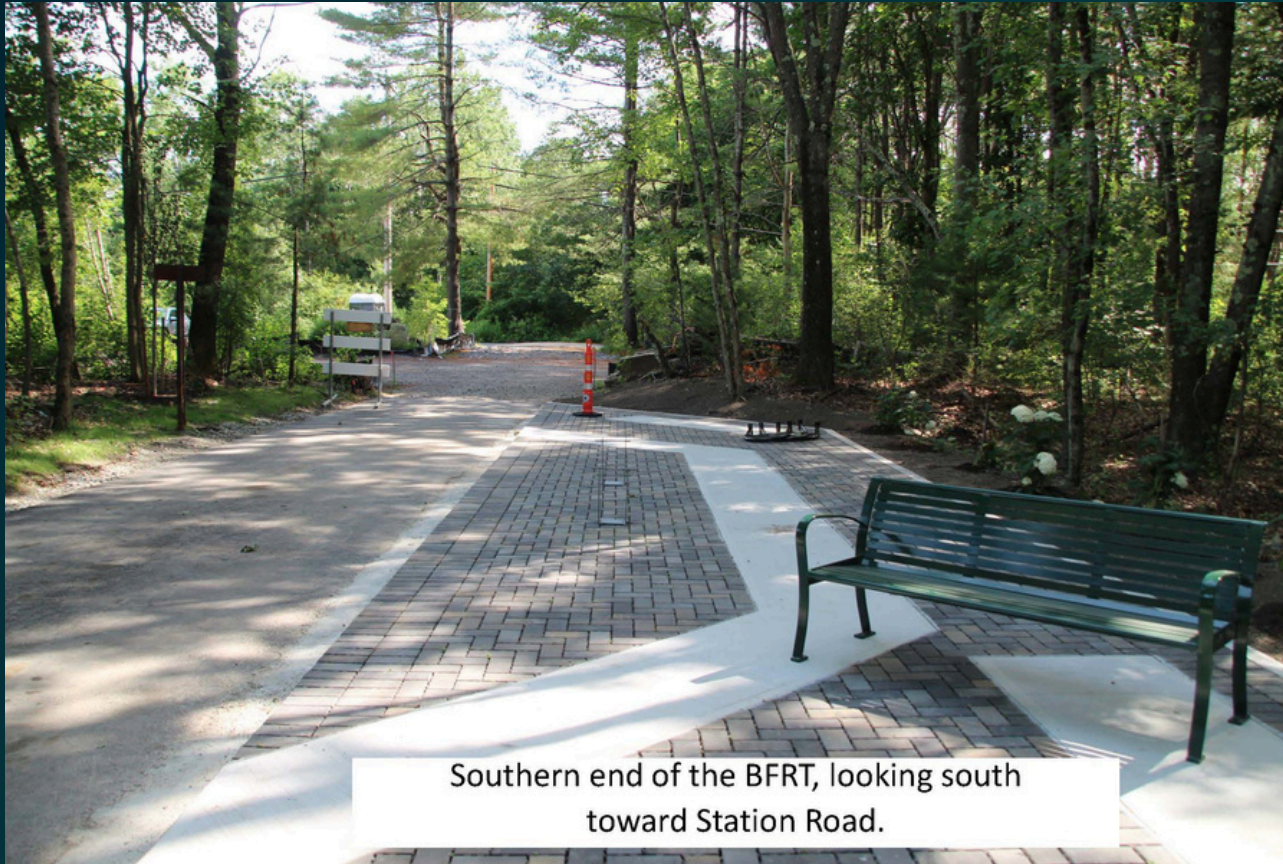
Southern end of the BFRT, looking south toward Station Road.