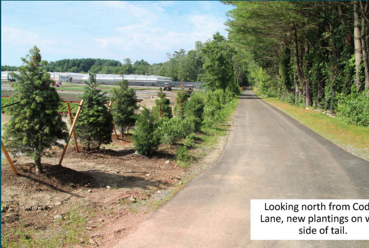
Looking north from Codjer Lane, new plantings on west side of trail.