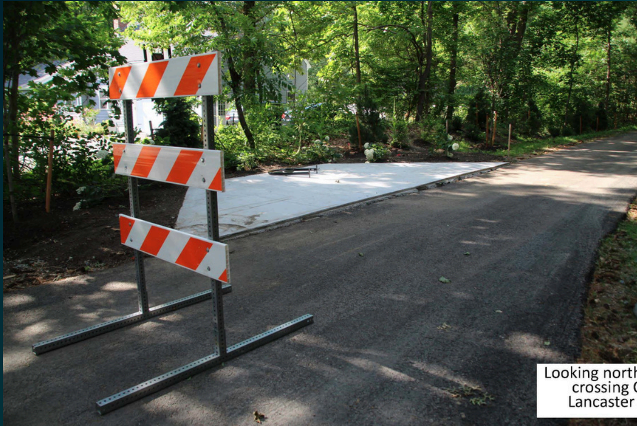
Looking north, BFRT crossing Old Lancaster Rd.