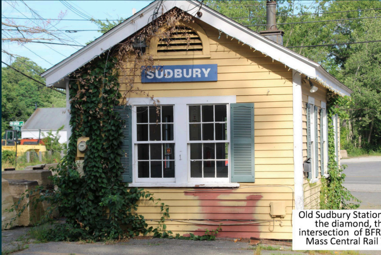
Old Sudbury Station near the diamond, the intersection of BFRT and Mass Central Rail Trail.