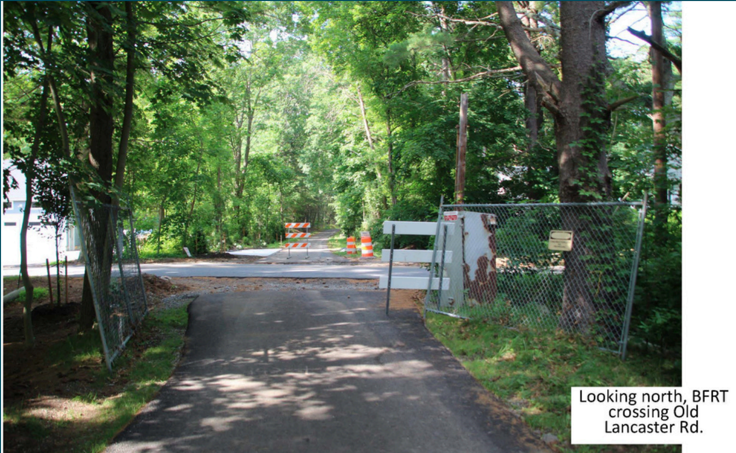
Looking north, BFRT crossing Old Lancaster Rd.