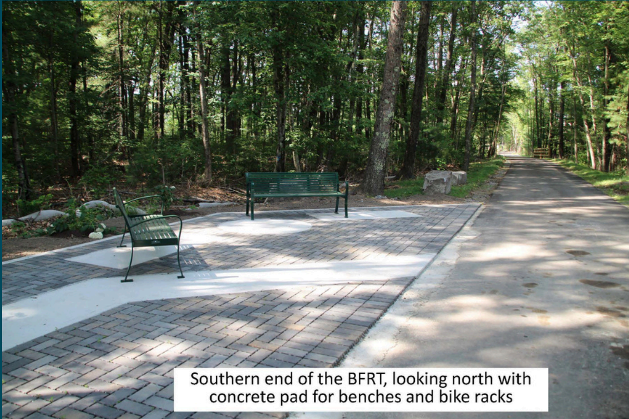
Southern end of the BFRT, looking north with concrete pad for benches and bike racks