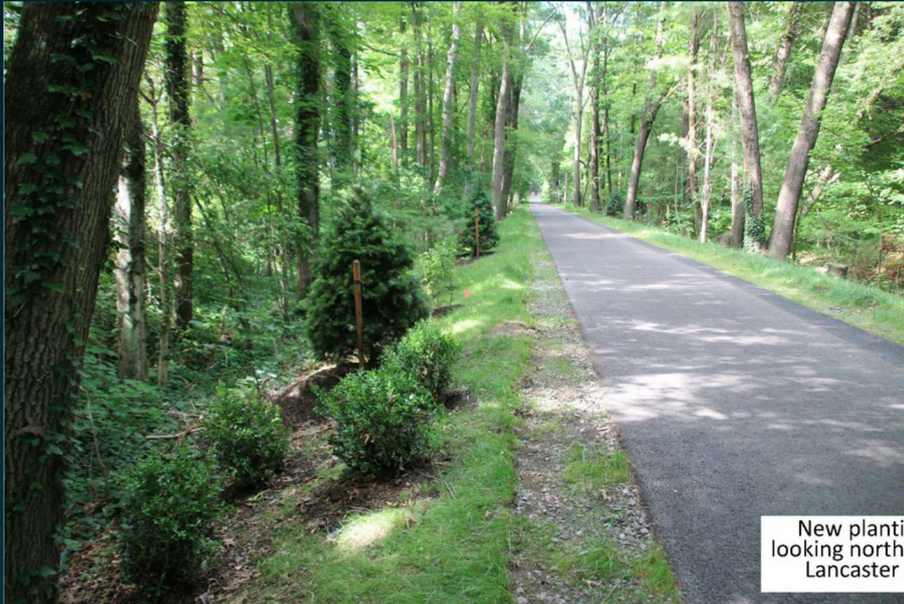
New plantings, looking north to Old Lancaster Rd.