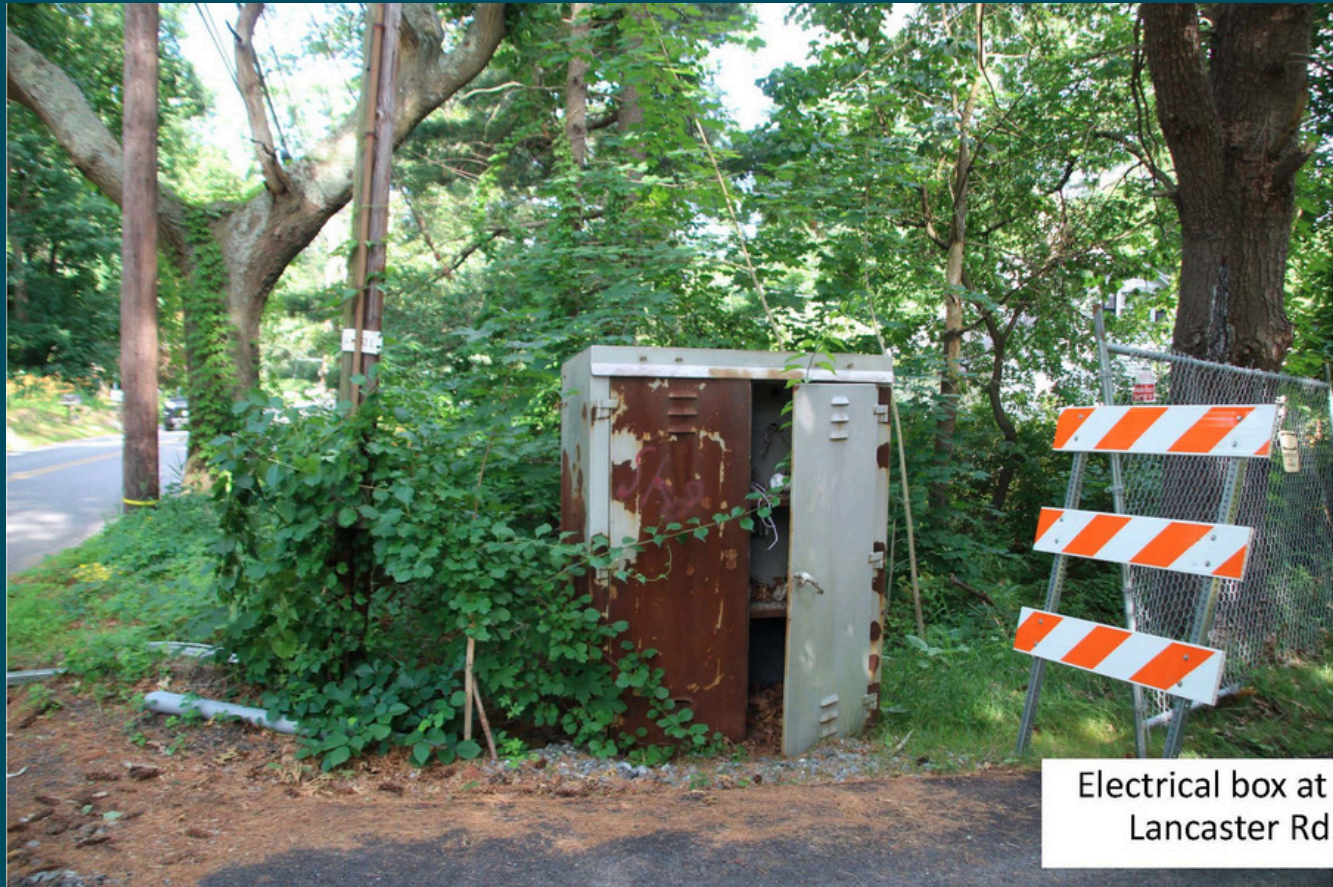
Electrical box at Old Lancaster Rd.