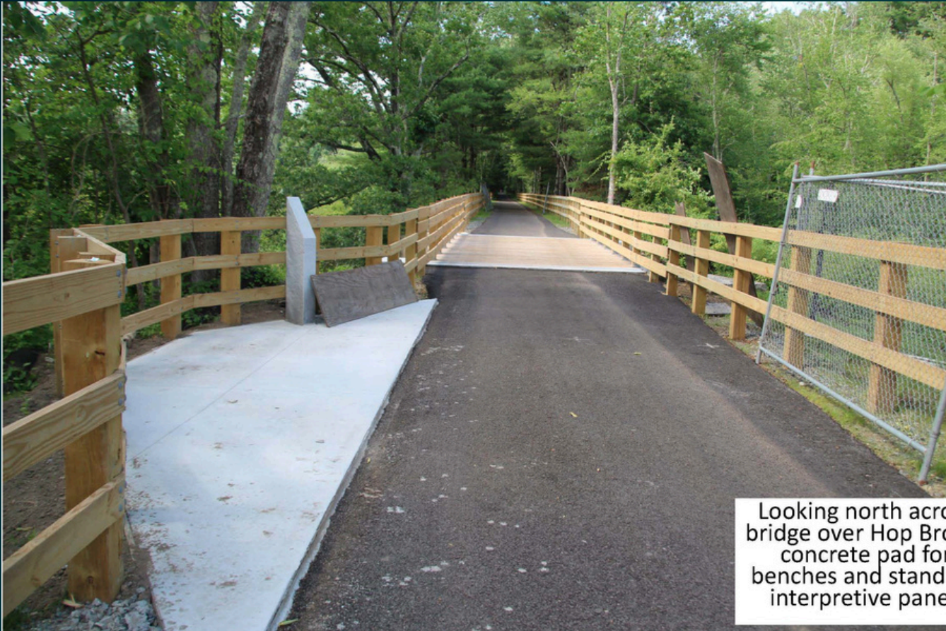
Looking north across bridge over Hop Brook, concrete pad for benches and stand for interpretive panel.