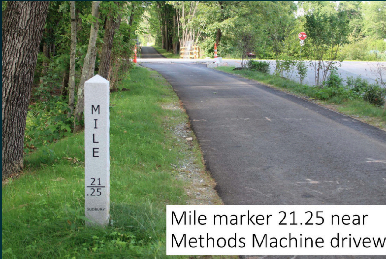
Mile marker 21.25 near Methods Machine driveway.