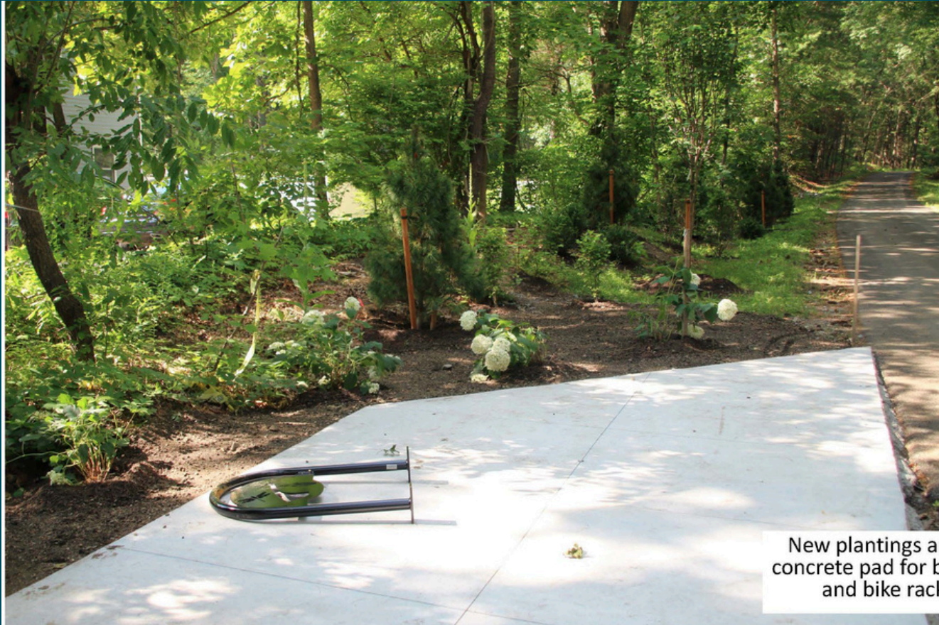
New plantings around concrete pad for benches and bike racks.