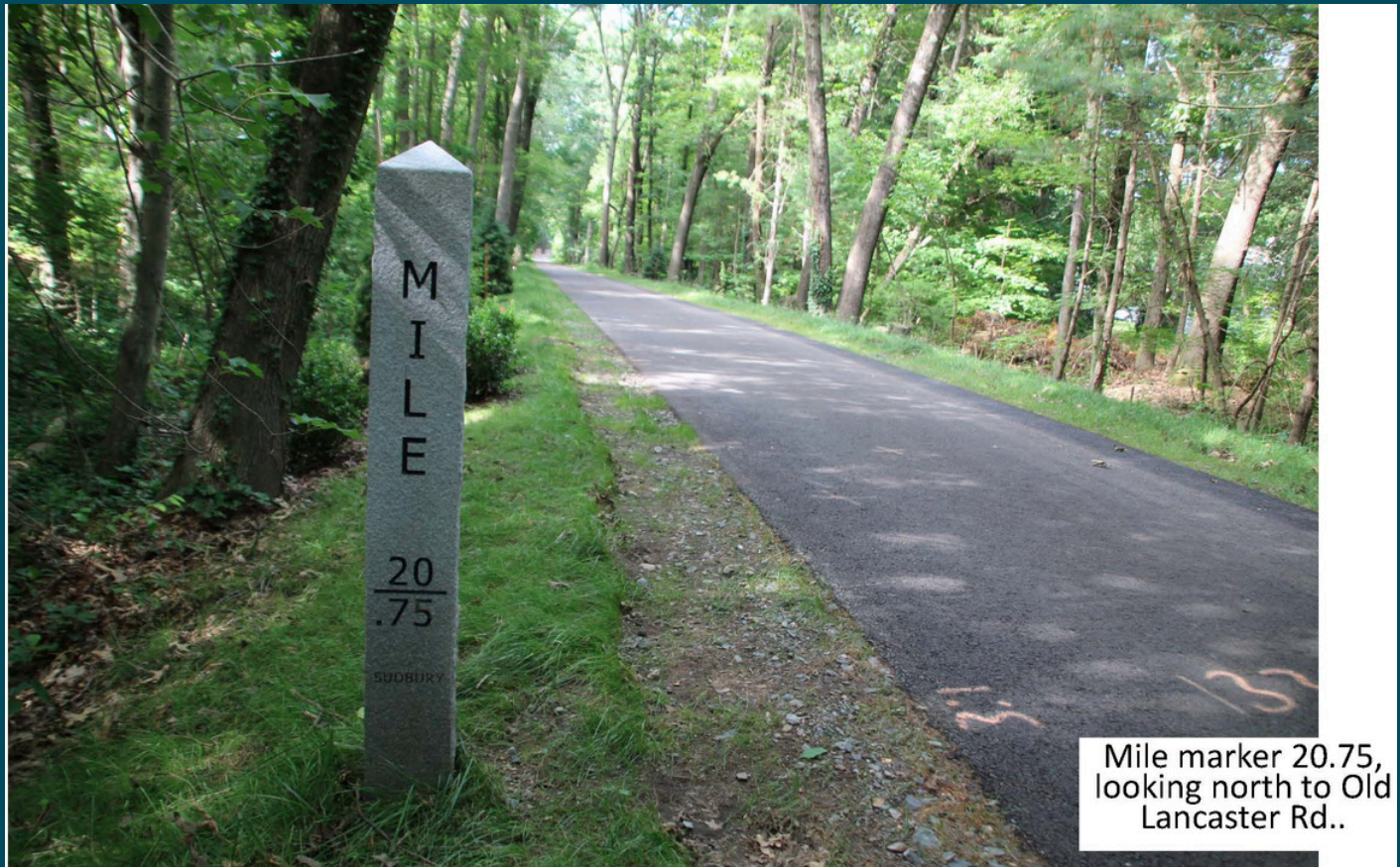
Mile marker 20.75, looking north to Old Lancaster Rd..