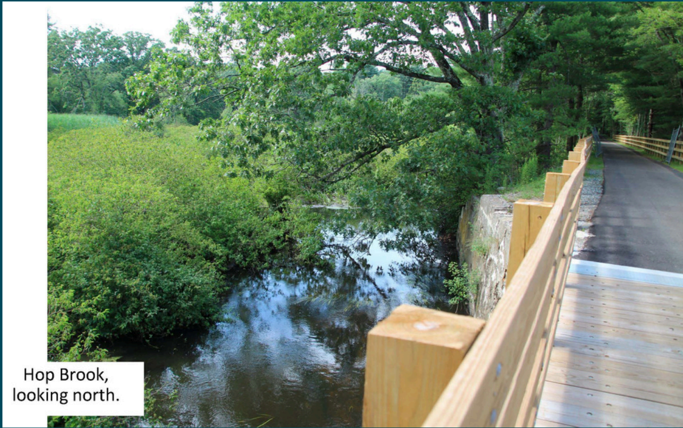
Hop Brook, looking north.