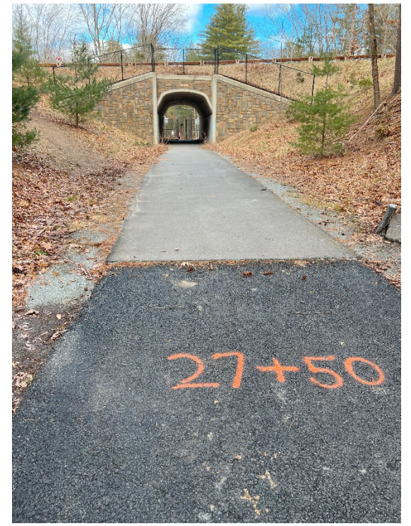
Photo 12: Sta. 27+50 in Concord looking north at the end of proposed work.