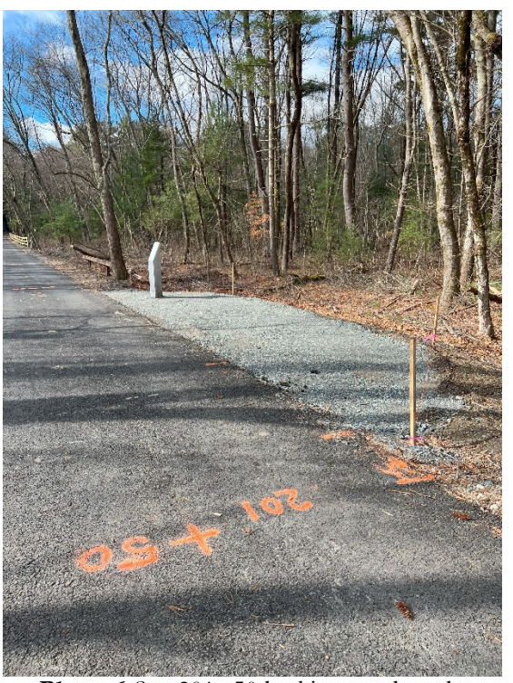
Photo 6: Sta. 201+50 looking south at the proposed rest area with a granite post.