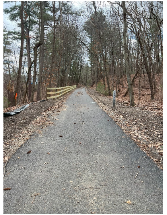
Photo 11: Sta. 23+00 in Concord looking south at the proposed fencing and granite mile marker.