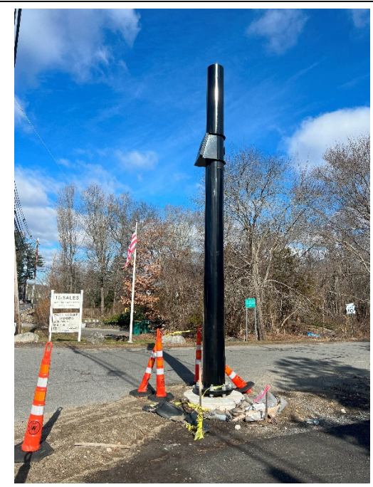
Photo 4 : Sta. 175+50 looking at the newly installed mast for the Hudson Rd/Peakham Rd intersection.