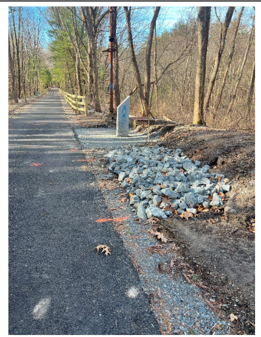
Photo 3: Sta. 163+50 looking south at the proposed rest area and modified rock for swale end.