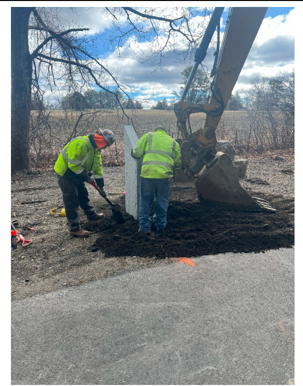
Photo 9: Sta. 261+00 looking at the proposed granite post being installed.