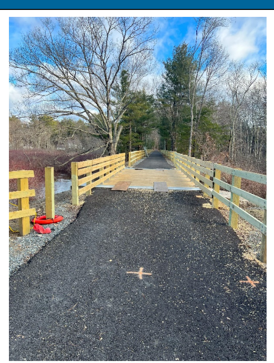
Photo 2: Sta. 126+00 looking north at the timber fencing across Hop Brook.