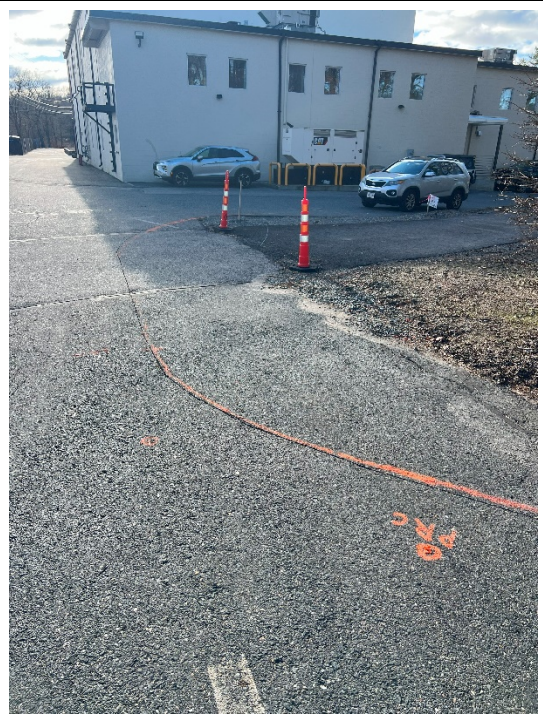
Photo 1: Proposed trail bump out sawcut and markings at the 71 Union Ave Driveway.