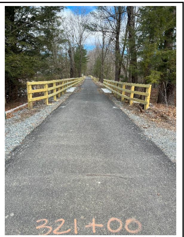
Photo 10: Sta. 321+00 looking north at the fencing across the cattle crossing.