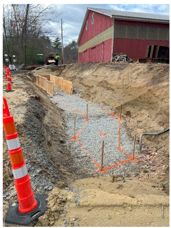
Photo 7 : Sta. 217+50 looking south at the retaining wall forms for the Morse Rd rest area.