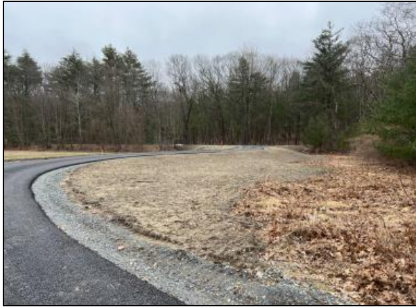
Spur entrance to BFRT from Parkinson Field