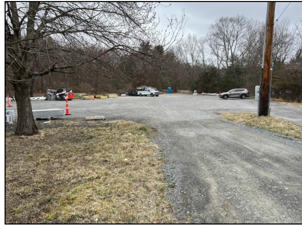
Parkinson Field Parking Lot