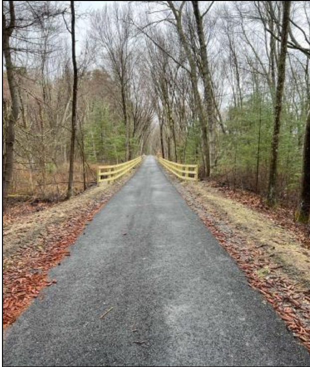
Mineway Brook Crossing