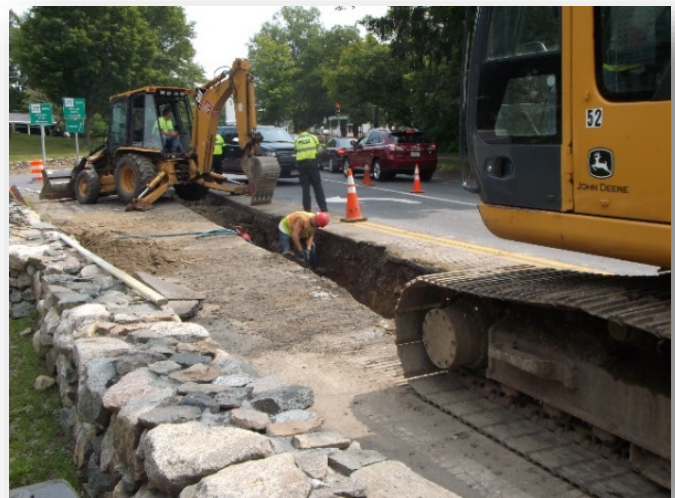
Pictured Above: Installation of a drain line on Concord Road. This drain line is part of the infrastructure being installed.

The utility companies will play an important role in completing the project by the end of August.