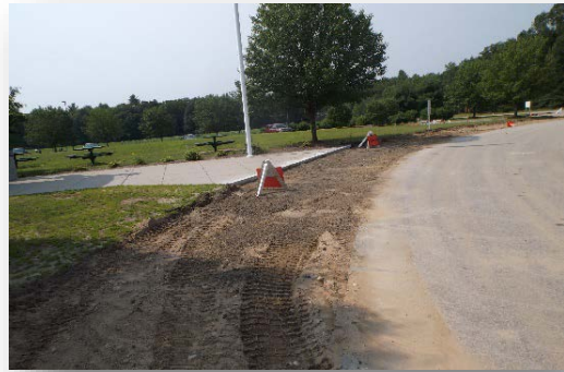
Pictured Above: Walkway construction in progress at Curtis Middle School