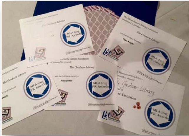
Pictured Above: Goodnow Library's Mass Library Association PR Awards