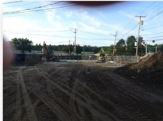
Pictured above: 430 Boston Post Road site