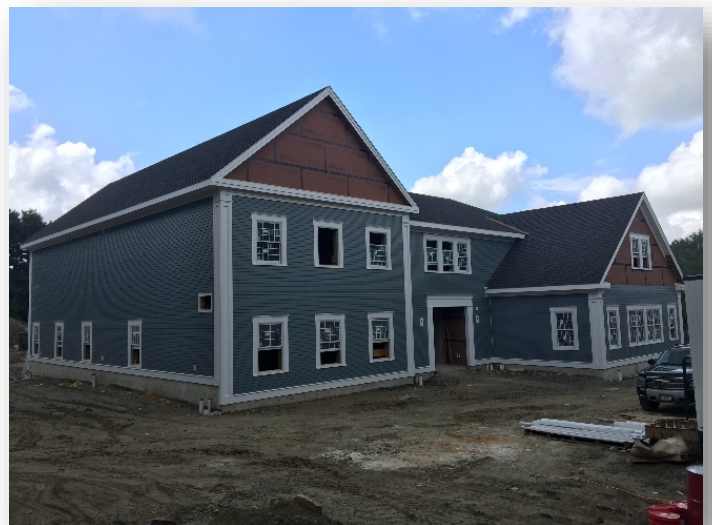
Pictured Above: Exterior of the new police station, photographed in July 2015.