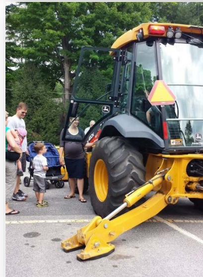
Pictured Above: Scenes from Truck Day