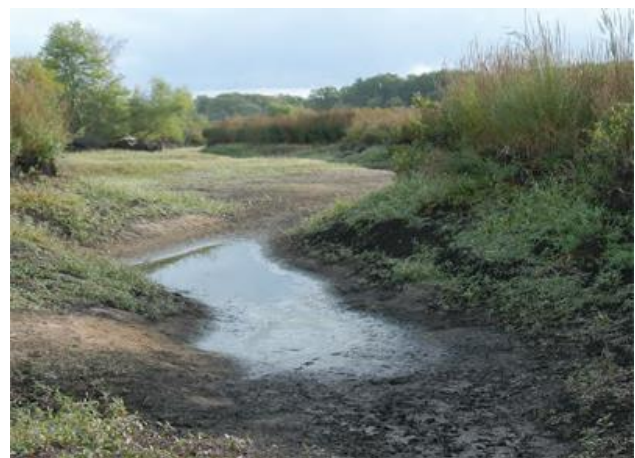
Shown Above: Water Levels at extreme lows.

The current ban on outdoor watering restrictions apply to those properties on town wells.