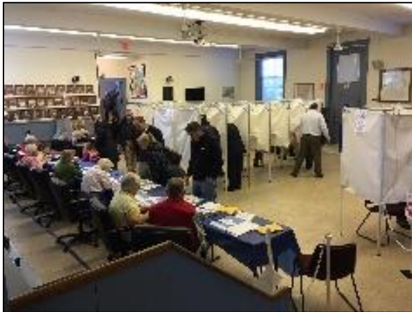
Voting taking place in Town Hall at the November 8, 2016 Presidential Election.

The State Election was held on Tuesday, November 8, 2016, at two locations. Precincts 1, 1A, 2 & 5 voted at the Fairbank Community Center, 40 Fairbank Road, and Precincts 3 & 4 voted at the Town Hall, 322 Concord Road. The polls were open from 6:15 AM to 8:00 PM. Early Voting was available this year for the first time in Massachusetts and was enthusiastically embraced by voters throughout the Commonwealth. In Sudbury, we had 4,720 voters who took advantage of the opportunity to vote early, over 36% of the total number of registered voters. In total, there were 10,940 ballots cast at this election, representing 84% of the Town's 13,003 registered voters. Please visit our website for a complete listing of the results.