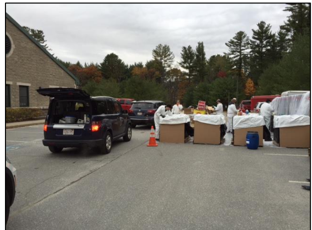
A team effort made household hazardous waste collection day a huge success.

contracted to collect items such as solvents, fuels, oils, acids, cleaners, thinners, and adhesives for safe disposal. Over 325 households dropped off hazardous materials for safe disposal. The quantities collected were significantly more than the last collection held in 2012.